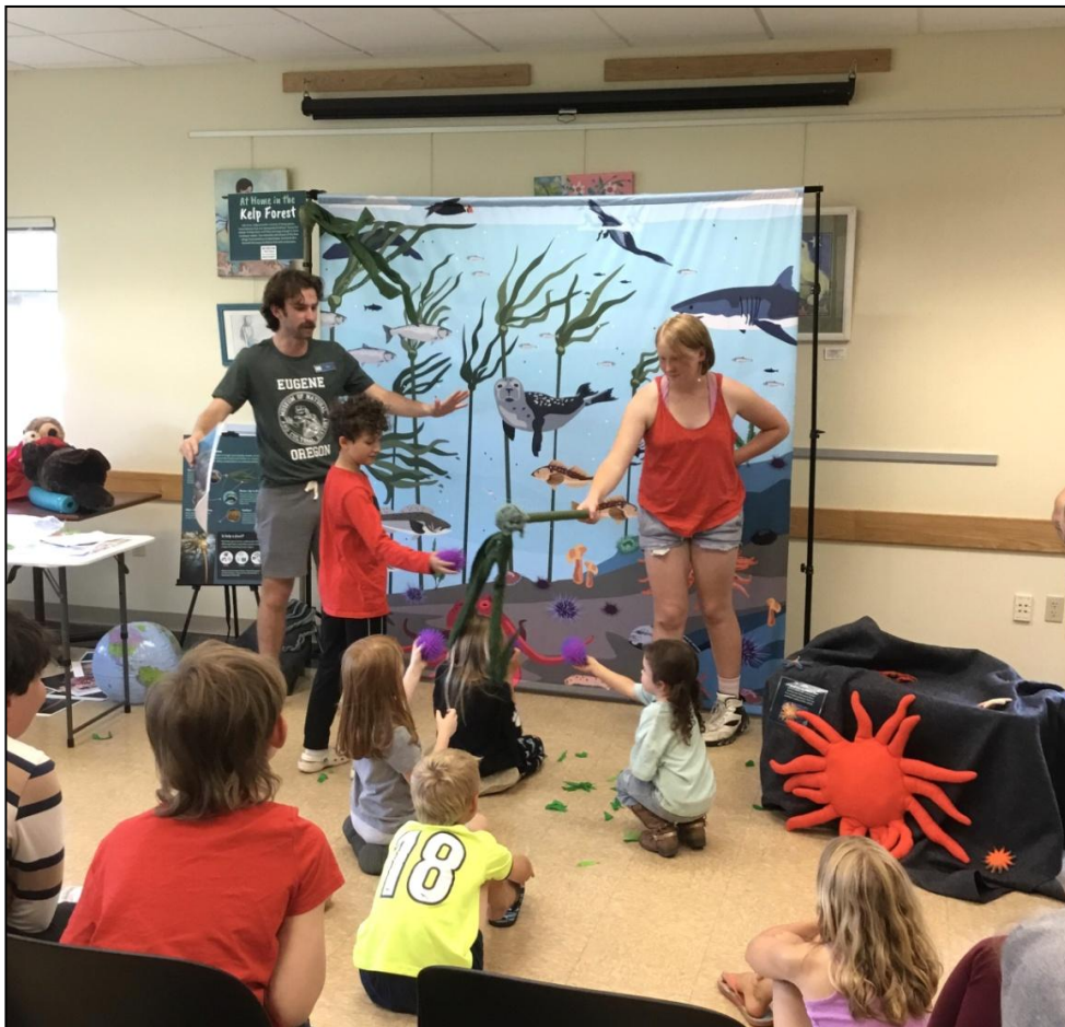
Sea Urchins and Kelp Under the Sea

Tuesday August 13 th Outdoor Summer Reading Finale Party 2-4pm