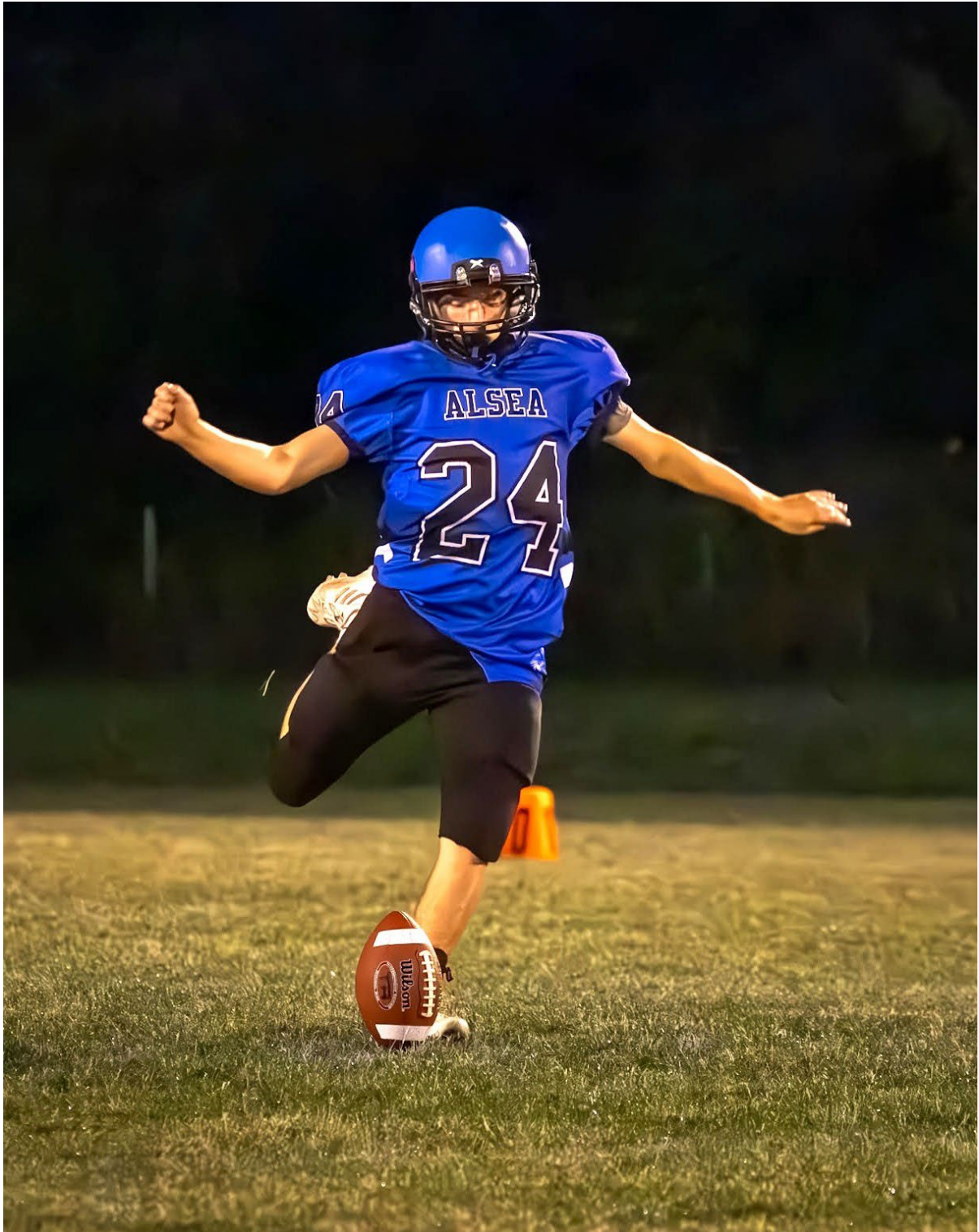
Alsea School Football