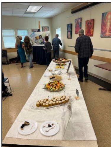
Thyme Garden Treats