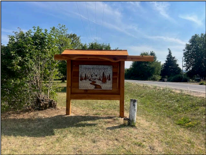
New Grange sign